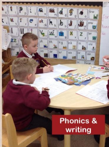
Phonics & writing