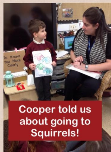
Cooper told us about going to Squirrels!