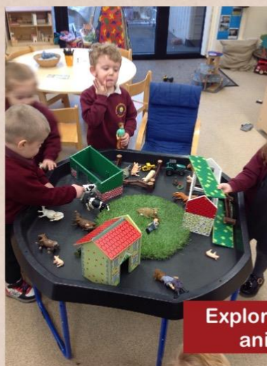
Exploring farm animals