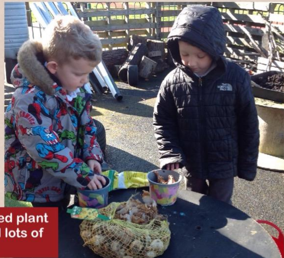
We have decorated plant pots and planted lots of bulbs 🌷