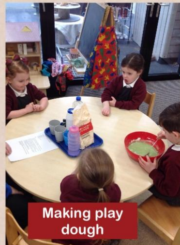
Making play dough