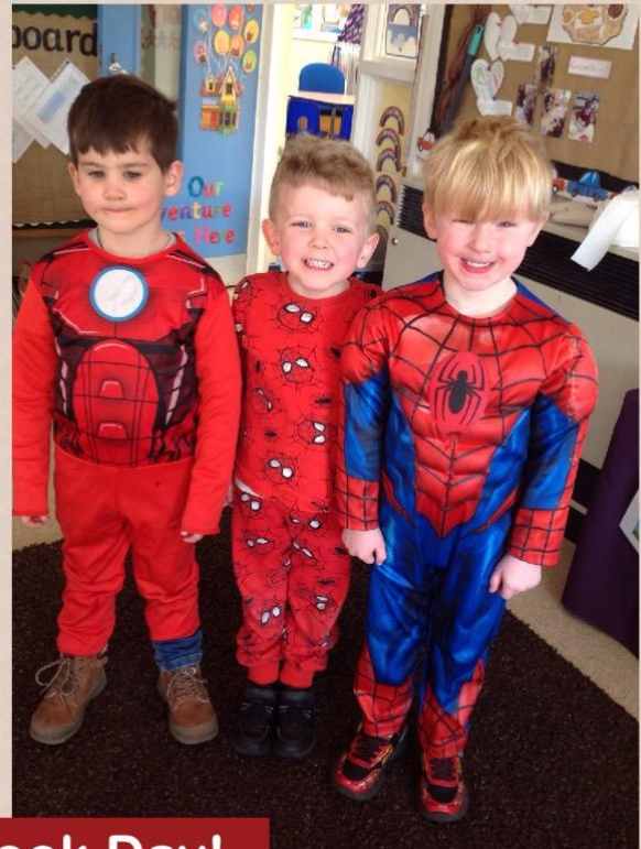
World Book Day!