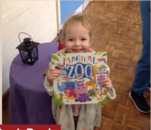
World Book Day!