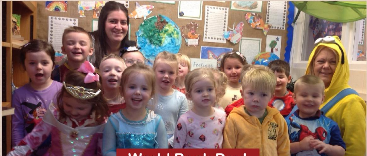
World Book Day!