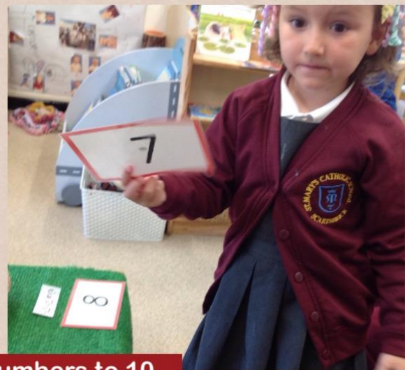
Ordering numbers to 10