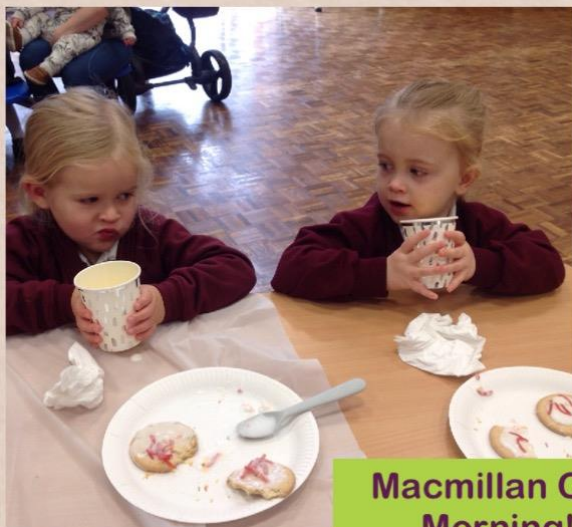
Macmillan Coffee Morning! ☕