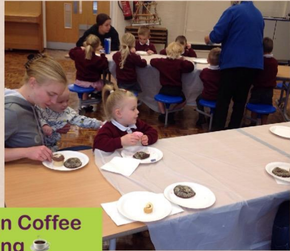
Macmillan Coffee Morning ☕