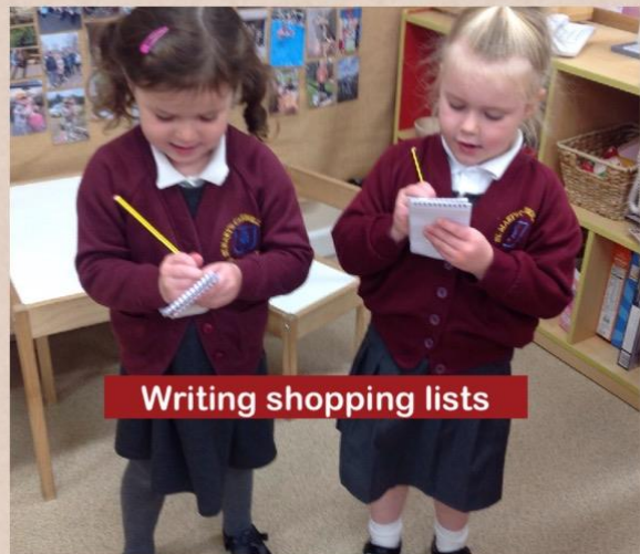
Writing shopping lists