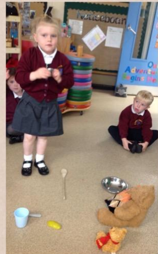
Big and small