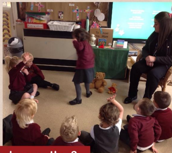
We made sure the 3 bears had the right sized picnic items!