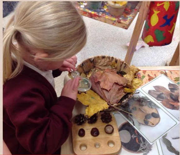
Exploring Autumn 🍂