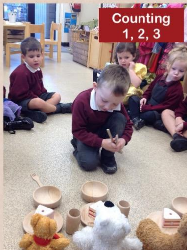
Counting 1, 2, 3