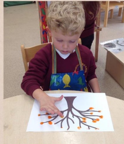
Painting Autumn trees 🍂