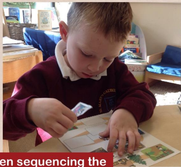
Reception have been sequencing the story of Goldilocks 🐼