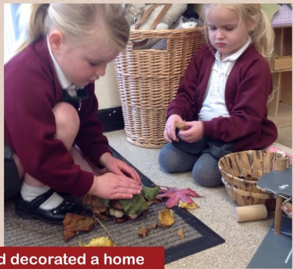
We made and decorated a home for Hedgie the Hedgehog to live in over the winter.