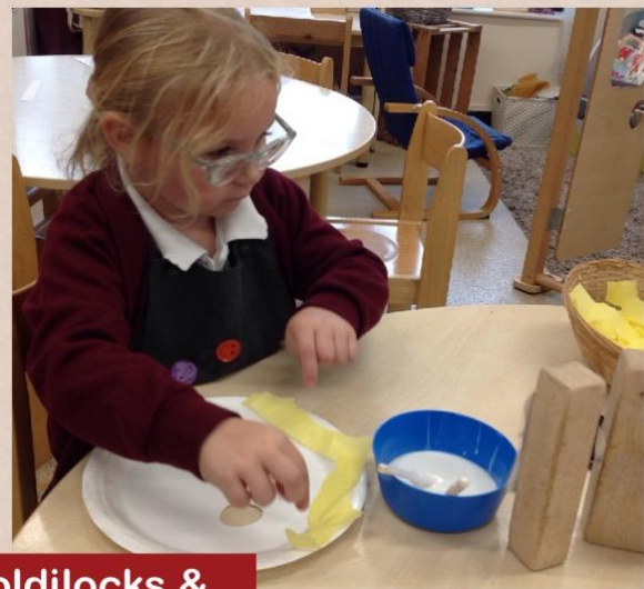
Making Goldilocks & the 3 bears masks 🐻