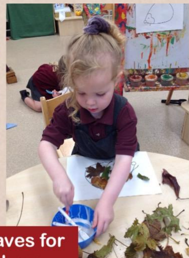
Using our leaves for leaf hedgehogs