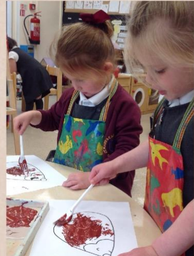
Painting with forks to make hedgehog spikes