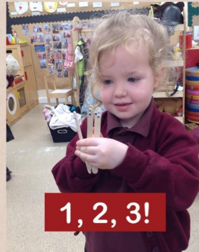
1, 2, 3!