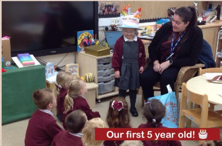
Our first 5 year old! 🎂