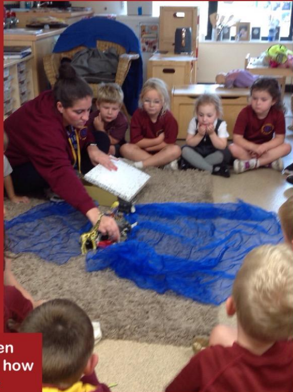
We used our Golden Box to tell the story 🌍