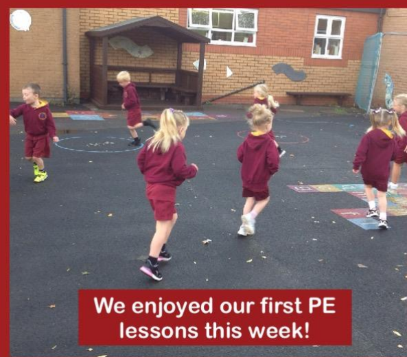
We enjoyed our first PE lessons this week!