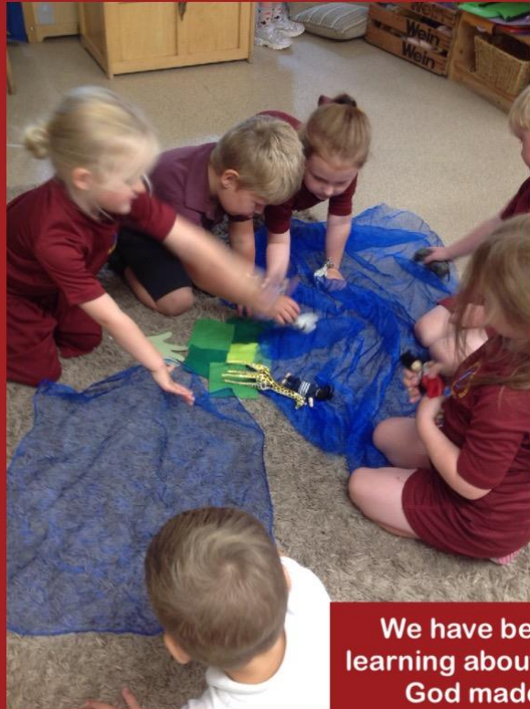
We have been learning about how God made everything in our world. 🌍