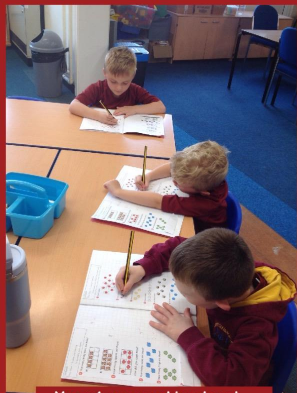
Year 1 are working hard...