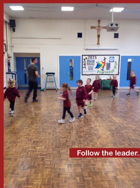
Follow the leader...