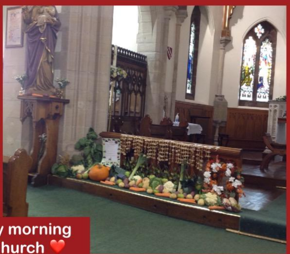
A Monday morning visit to Church ❤️