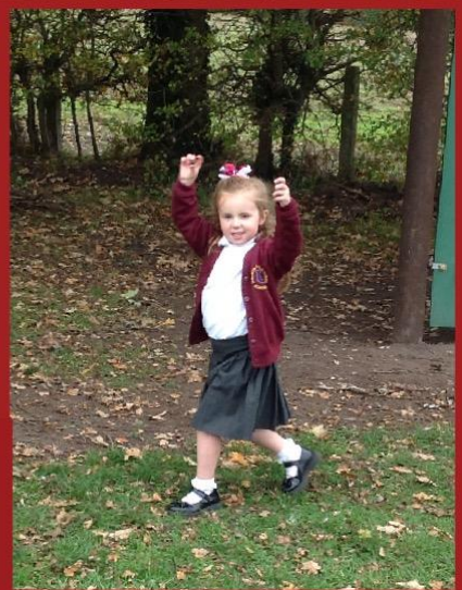
Nursery & Reception went on a walk around school to find signs of Autumn and then made Autumn collages with them.