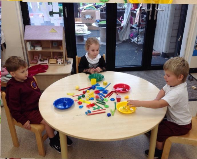
Colour Matching and taking turns.