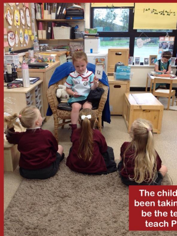
The children have been taking turns to be the teacher & teach Phonics!