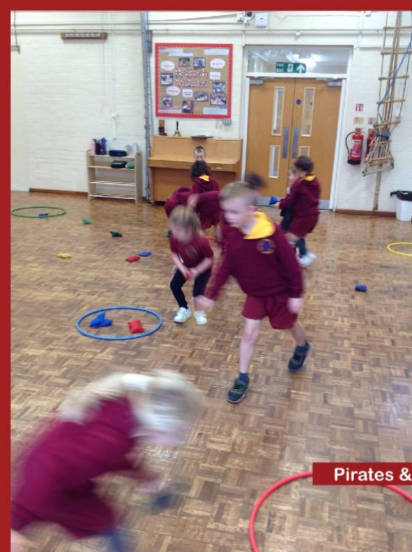
Pirates & Explorers...