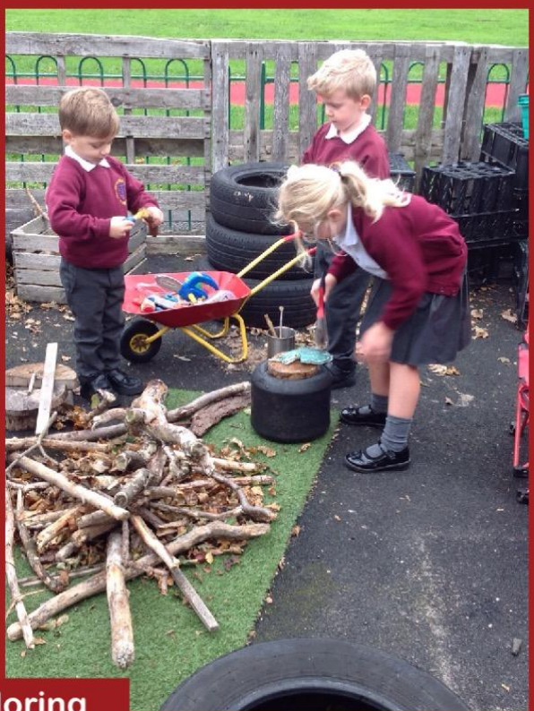
Exploring outdoors 🌲